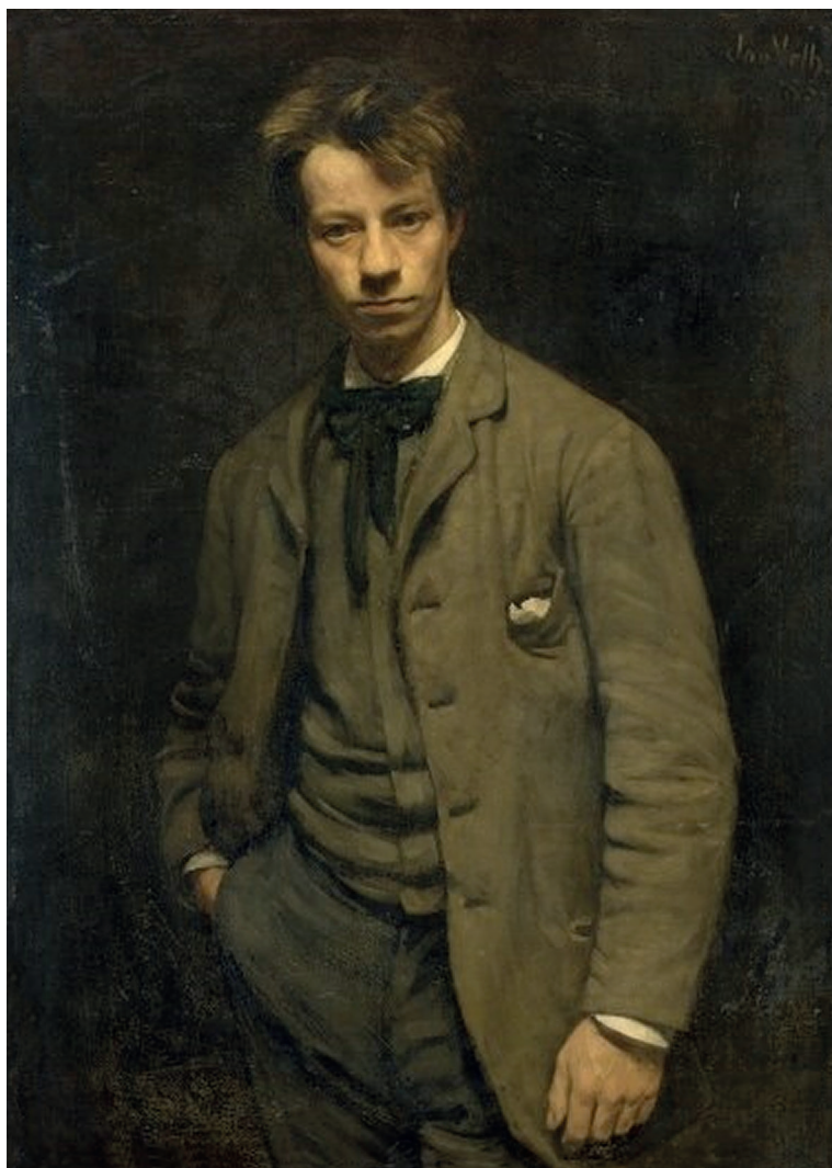
Fig. 6. – Jan Veth, portrait of the poet Albert Verwey. Amsterdam, Stedelijk Museum.

flamboyant artist”, he wrote, with the wishful thinking of someone who eagerly wanted to be the opposite of what he knew to be his own natural character. An example of a “wild” painting was his unconventional portrait of the Dutch poet of the time Albert Verwey (fig. 6): not a stiff sitter but a nonchalant poète maudit . Painstakingly precise, Veth portrayed his subjects the way they were, for better or worse. Up until 1915 he made dozens of portraits in Germany as well: artists and politicians or people from the