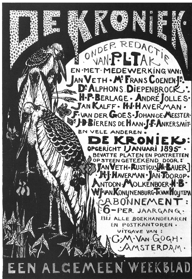
Fig. 3. – De Kroniek , cover. Leiden, University Library.