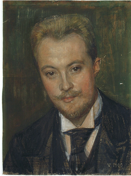
Fig. 7. – Jan Veth, portrait of André Jolles, 1894, made over in 1900. Private collection.

Jan Veth (fig. 7), clearly signed in the lower right corner: I and V (which stand for Jan Veth), 1900. In my opinion this is in all probability a remake of the drawing of 1894. The drawing was in gouache, reworked with oil paint. There is no photograph of the original 1894 drawing, so we had in a way three portraits by Jan Veth of Jolles as a young man: the original of 1894, the portrait of 1896 (fig. 8) and the makeover portrait of 1900 (fig. 7).